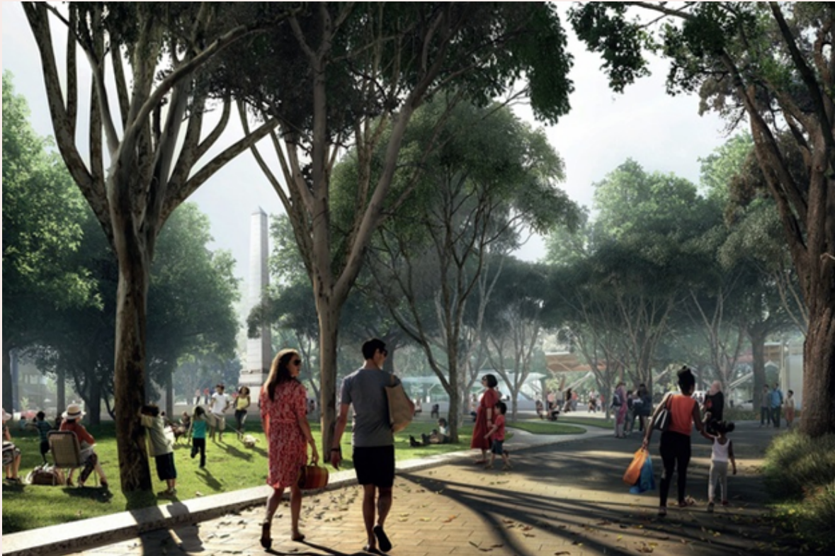
Concept image of Albert Road Reserve