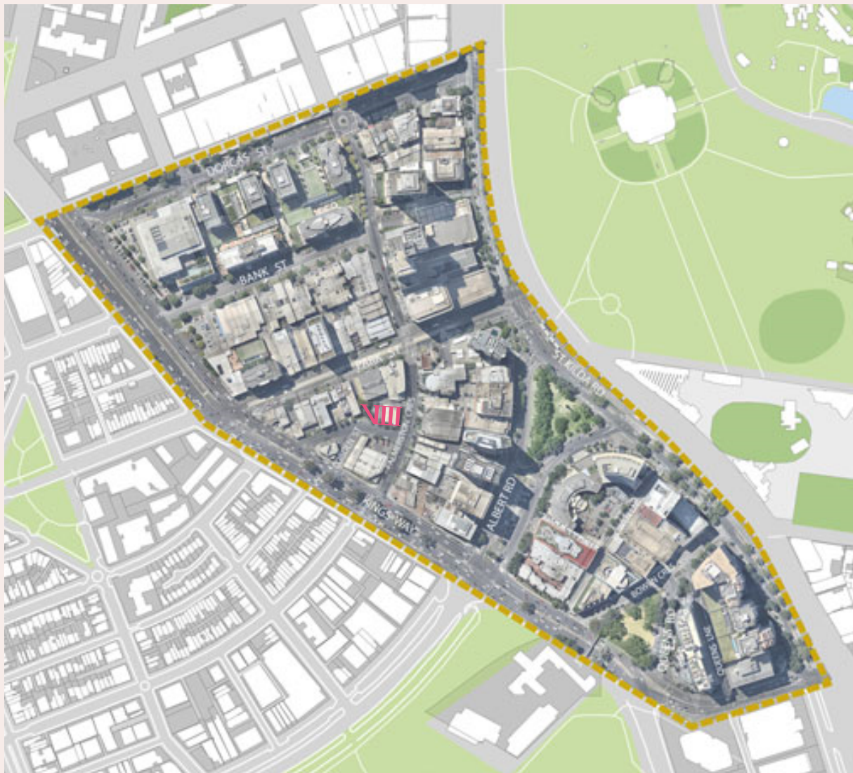
The Domain Precinct is the area bounded by Kings Way, Dorcas Street and St Kilda Road.

Crema attended the community feedback and identity workshop in August of 2018. Council indicated that improved streetscapes and walkability would be a focus of the future works. It is understood that the Master Plan will look to incorporate higher-quality trees being planted and better connections between streets, existing tram stops and the new train station.