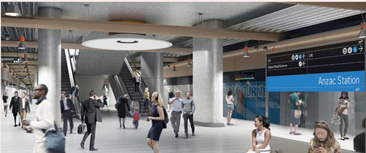
Concept image of Anzac Station.