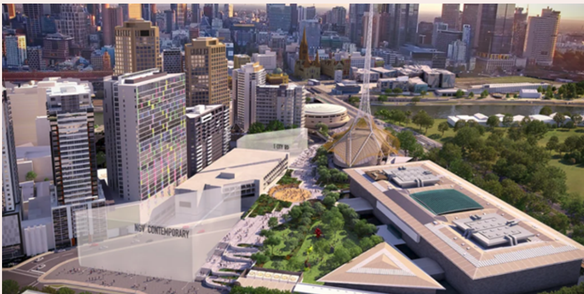
Concept image of the renewed Melbourne Arts Precinct