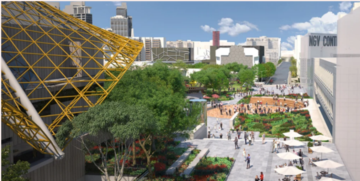
Concept image of the renewed Melbourne Arts Precinct

Australian leading design studio, Hassel and New York-based Solid Objects Idenburg Liu have been awarded the design contract.