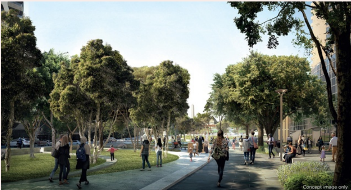
Concept image of Albert Road Reserve