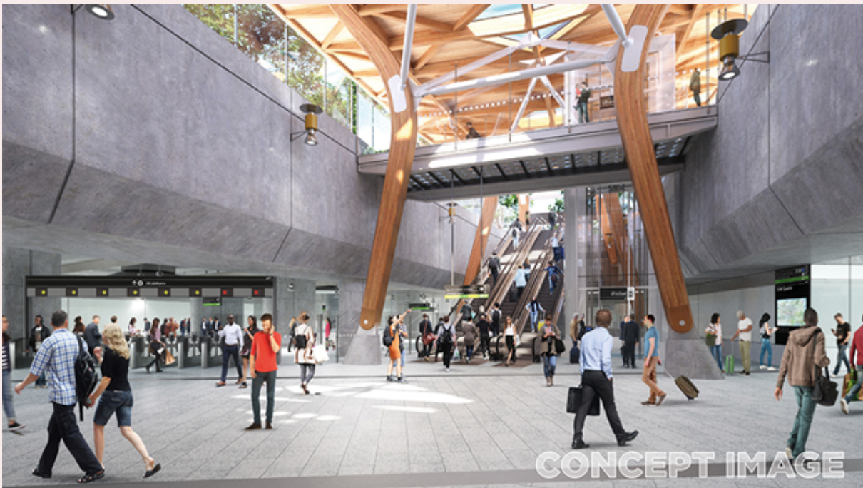
Concept image of Anzac Station.