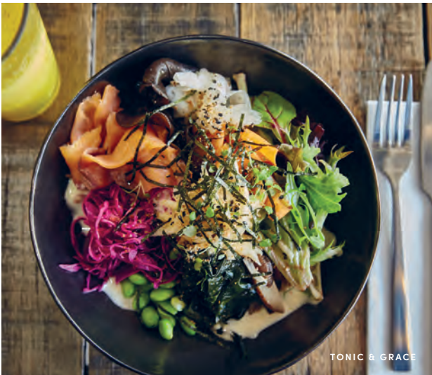
TONIC & GRACE